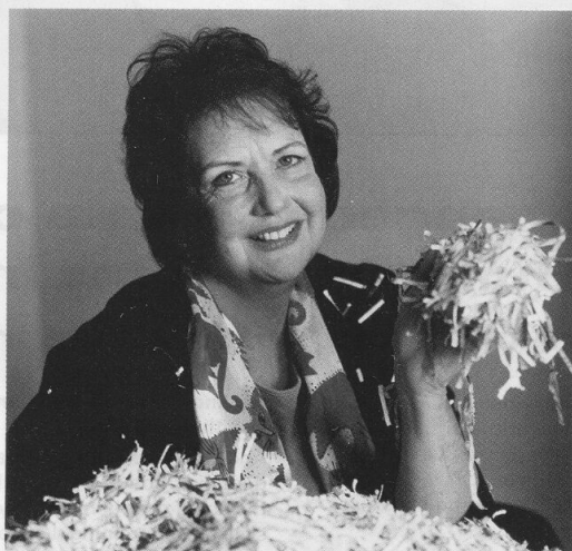
PAPER JAM: I still have the warranty and the receipt from the last 23-inch color television we bought. I just don't have the TV.

and process all of it? Are we simply in love with information for information's sake? If you've ever spent half a day in your pajamas while you fill out your tax return, as I did a few months ago, you can't help noticing that this tsunami of stuff keeps getting in the way. It glazes the eyes. It numbs the brain.