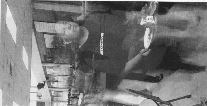
HEALTHIER CHOICES: Granola bars, nuts, baked chips and Frito-Newman are available in cafeteria vending machines

parties and allowing bake sales—although students can't eat their purchases until the last bell has rung. And while kids can still bring whatever they want for lunch from home—"If you want to send deep-fat-fried Twinkies every day, that's your business," says Combs—no sharing is allowed.